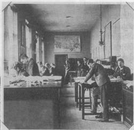
The Drawing Office

Unveiled by HRH The Princess Royal, a Vice President of the Society 11th July 1997